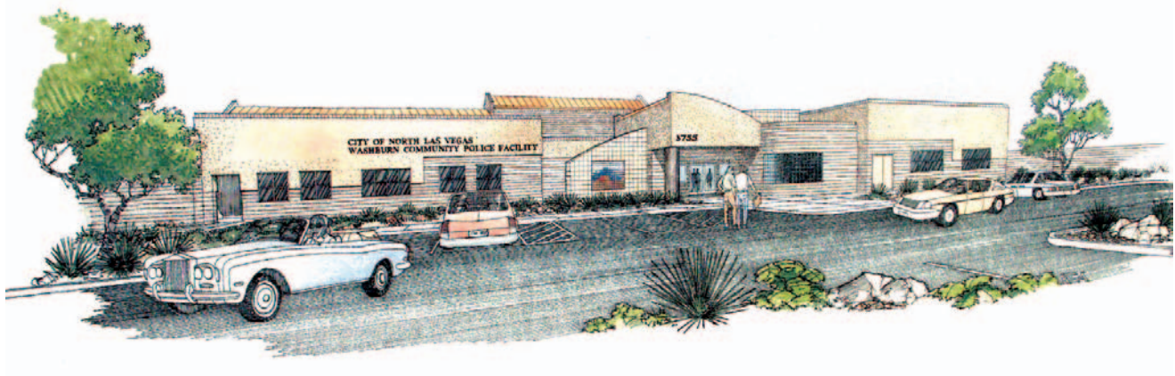
Artists' rendering of the Washburn Police Facility to be located at the corner of Washburn road and Allen Lane. Scheduled to open in 2004, the facility will house 125 officers.