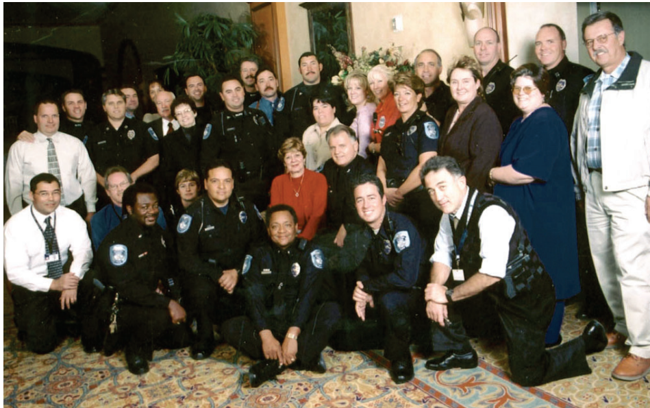
Police Department staff receiving service awards - November 2003.

To maintain and improve community livability by working with all community members to preserve life, maintain human rights, protect property and promote individual responsibility and community commitment through professional accountable and ethical service.